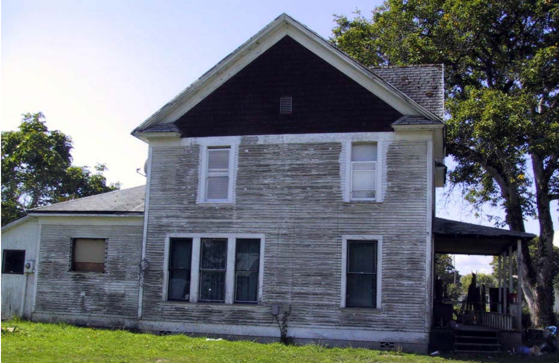
2003 photo of the old parsonage which was moved from its original location of 1 st and C Street to its present location on 1 st and Shear Street. This is where the Osgood family and many other pastors and their families lived while serving Castle Rock Christian Church.